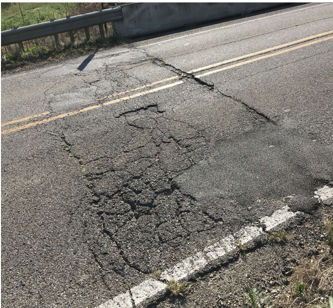
PHOTO 1 Description Approach roadway